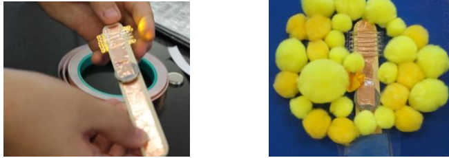
Fig. 3. Student experimenting with multiple LEDs (left) to build a “sun” object (right).

All students of the second workshop appreciated the workshop (5 out of 5) but for a wider range of reasons. On the one hand, a student noted during the final discussion that “doing the play!” was the best aspect of the workshop and another stated that “I like this activity because I get to profess in my artistic skills.” On the other hand, a more technical inclined participant “really liked the technology part: making things light up.”