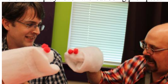
Fig. 1. Participants of the expert workshop spontaneously break into play.

Workshop Observations and Feedback. The expert workshops did not include a performance condition but especially participants of the first workshop at the Center for Puppetry Arts “broke into play” even without being prompted.