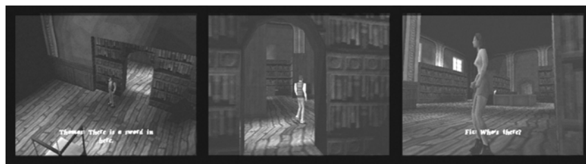
Figure 3 – Combining a change of POV and interactive access in Common Tales

Throughout the prototype, various forms of cinematic mediation were mixed: from player-controlled interactive cameras to pre-rendered video scenes that consisted entirely of pre-defined camera-work. With such a vocabulary of available expressions, different player-positionings were visualised often in direct combination with a change in the interactive access. For example, the effect of changing controls from one character to the other is introduced after the player has led Thomas into a virtual library to fulfil the first task set in the game: find the magic sword Excalibur. Entering the small room that contains this sword triggers a short pre-scripted scene in which Thomas picks up Excalibur and leaves the room. On leaving, he is spotted by the second character – Fiz. Not only is this indicated through a camera cut, but also by the change of the player's control that switch to Fiz at the end of this cut-scene.