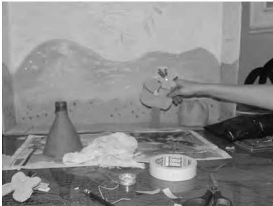
Figure 2. Creating a complete stage (Medellín workshop)

The work in Medellín started with an adaptation of the tutorials. The first approach to testing the tutorials was pilot tested by Isabel Restrepo and another adult with elementary school children. Since they needed to incorporate recycling materials, the original materials, which included sturdy craft paper, was replaced by cardboard from a box. The use of this material allowed the creation of larger entities and led to a stage for the puppets. This was a creative decision of the children but also included complications for the construction process. For example, scissors were not the right tool to cut the cardboard and the adults needed to help the children by using a scalpel.