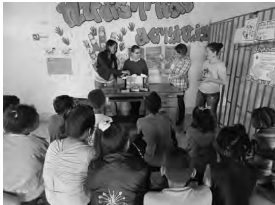
Figure 4. Performance situation on location (Medellin workshop)

children rehearsed, performed and evaluated the overall experience.