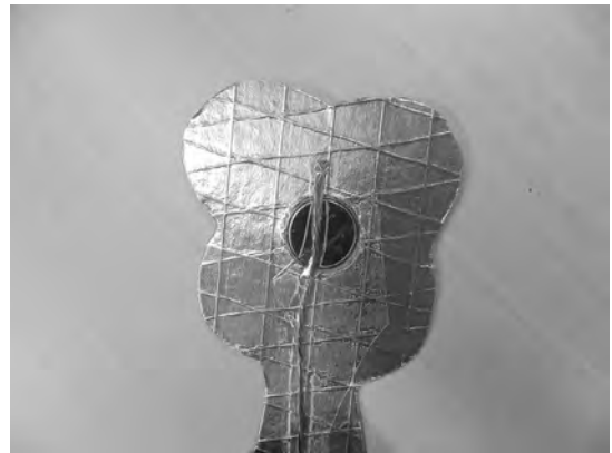
Figure 3. Medellín flower-tree design with aluminum adhesive

The team found an alternative material for the conductive tape: aluminum foil coated with rubber adhesive. This material that generated further changes from the original Atlanta design. The adhesive tape covered a big part of the character and electrical wire was used to warranty conductivity between the battery and the aluminum adhesive. Once the puppet prototypes were done, the team created a narrative by using the surrealist methodology of the Exquisite corpse or Cadavre exquis . This strategy generated the need for designing extra props and a more elaborate stage including a rolling background. In this way, the team designed a kit-like scaffolding with all the needed elements to perform the piece as an introduction for the workshop with children.