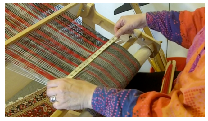
Figure 3 A collaborating crafter working at home

In a second step, students engaged in the chosen craft form. If the first analysis was a purely technological breakdown of the process, then this second step was the experiential exploration of what it feels like to weave, knit, bake, craft. Finally, we designed digital components to transform the existent practice. Over the course of the next weeks, prototypes were built and presented to the crafters for initial feedback.