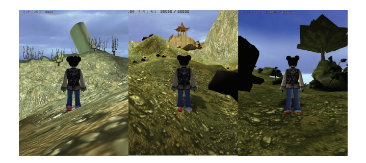
Figure 1: Different Elements

together from infinite tiles that are calculated on demand and then placed in the world.