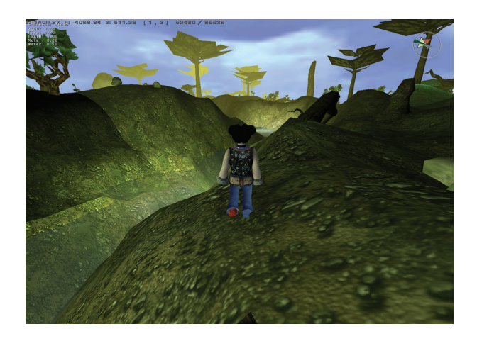
Figure 2: A tile split by a river.

side of the river. If the player is in one of the areas, there is no way for him or her to move to the other side of the graph without the appropriate key.